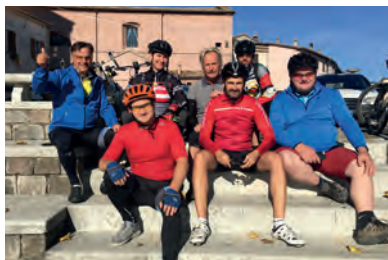
Impressions from previous tours